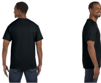
Featured Color: BLACK