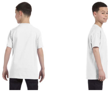
Featured Color: WHITE